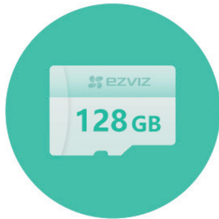
Supports MicroSD Card

The LC1 comes with a built-in MicroSD card slot that can store up to 128 GB of recorded footage. You can also save your images to EZVIZ Cloud for additional back-up. (Cloud storage service is only available in certain markets. Please verify the availability before making any purchase.)