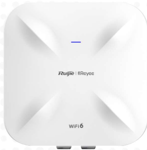
Figure 1-1 RG-RAP6260(G)